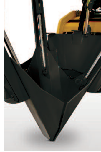
Cuts a 30" diameter root ball 29" deep with fully truncated blades. Blade angles are 25°.