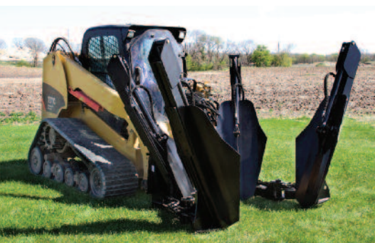
Model 4S with 4 steel cutting blades shown here.

Turn your skid loader into a high-speed, labor-saving transplanting unit. A tree can be dug or transplanted without the operator having to leave the loader. Spade is designed with a very short frame reducing the need for stabilizers and counterweights. Fingertip controls are integrated into the loader handles. The blades of the tree spade overlap to ensure clean root cutting and support of the root ball.