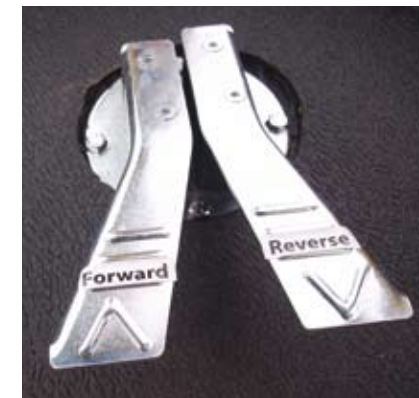
TRAVEL CONTROL Dual hydrostatic transmission foot controls are more responsive and comfortable for operator comfort.