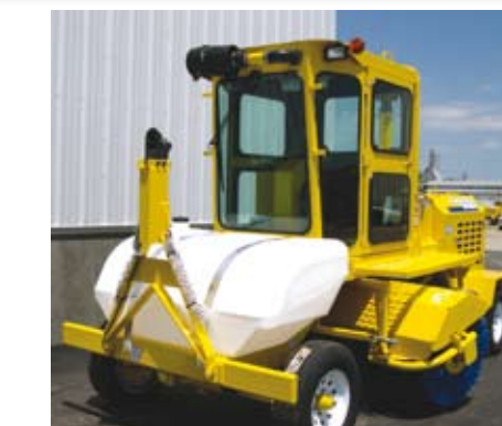
TOW PACKAGE Neutral shift for towing makes moving your Superior Broom easy with fold down tow hitch and safety chains.