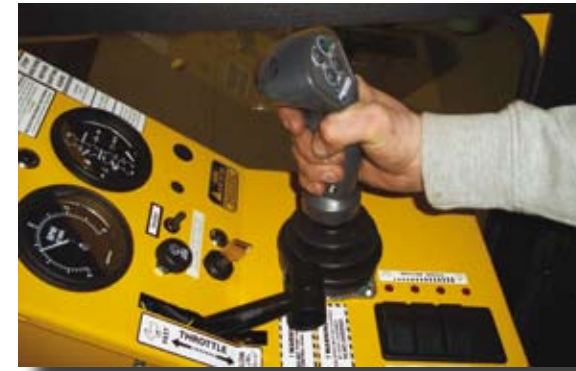
BROOM CONTROLS Electronic joystick control for all broom functions with red LED lights indicating brush speed, full gauge package with tachometer, oil & water gauge, volt meter, fuel gauge and sealed rocker switches with red indicator lights.