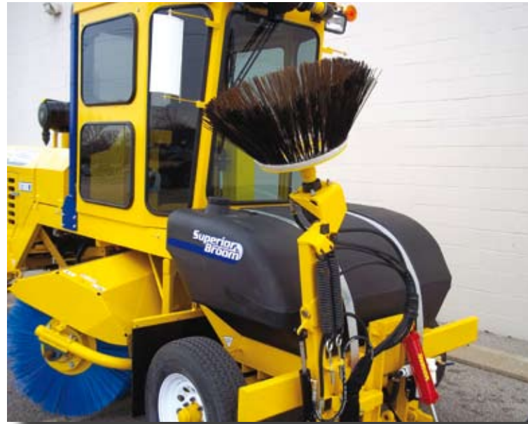
OPTIONAL GUTTER BRUSH Gutter brush has 27 inch brush head with hydraulic power angle, tilt down pressure and float. Brush is mounted to front bumper for better operator visibility and folds up when not in use.