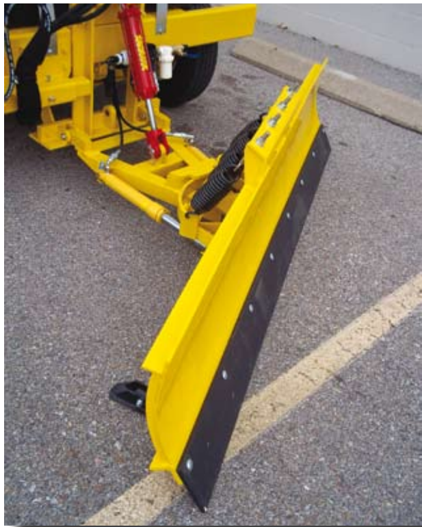
OPTIONAL SCRAPER BLADE Cutting edge is 7 1/2" with power angle, down pressure & float positions for cleaning packed heavy material.