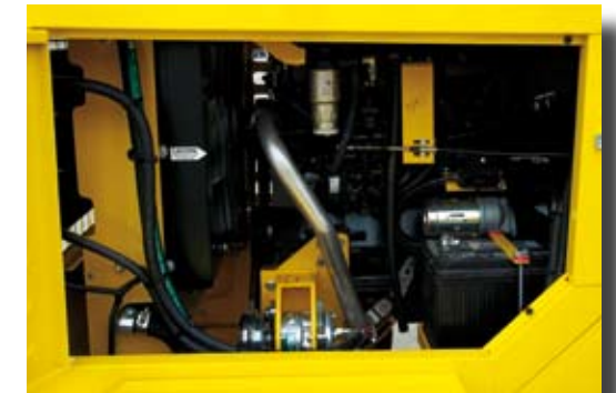
EASY ENGINE ACCESS Engine cover doors on right and left sides provide easy access for maintenance.