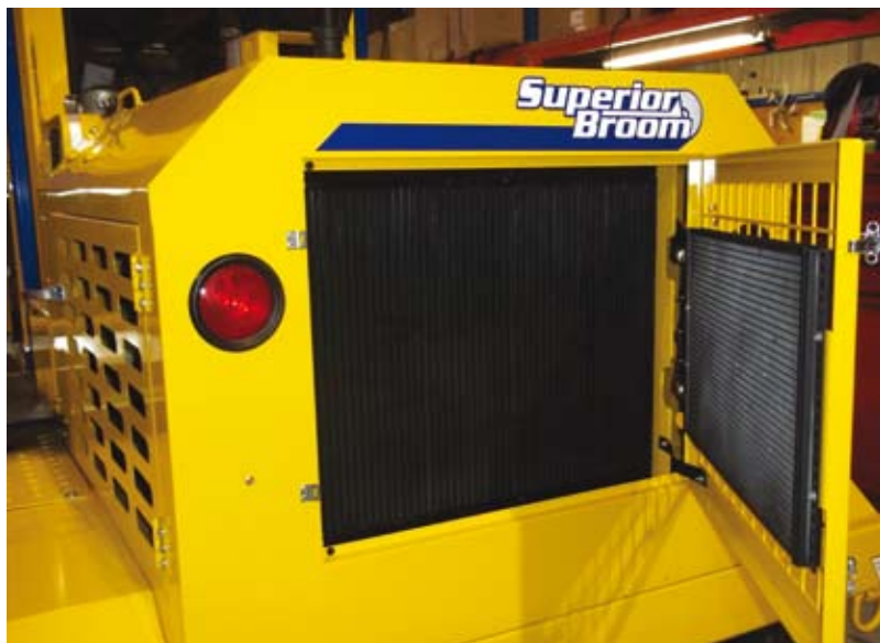
RADIATOR-OIL COOLER ACCESS DOOR Standard swing out door for easy cleaning and maintenance of your radiator, oil cooler and A/C condenser are vital to dependable operation. Proper hydraulic oil temperatures are key to extending the life of your hydraulic components. Superior Broom makes it easy to keep your coolers clean.