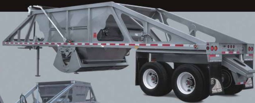
Switch Gate Bottom Dump