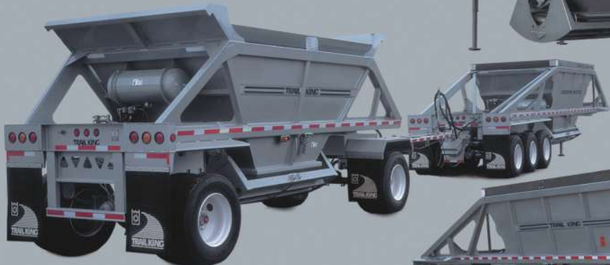
Bottom Dump Trains