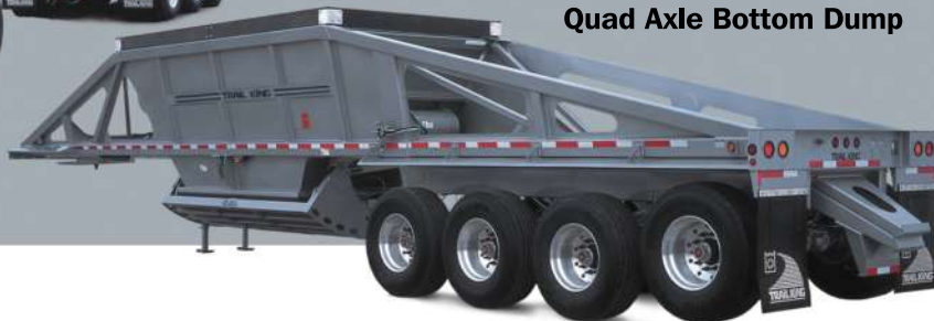
Quad Axle Bottom Dump